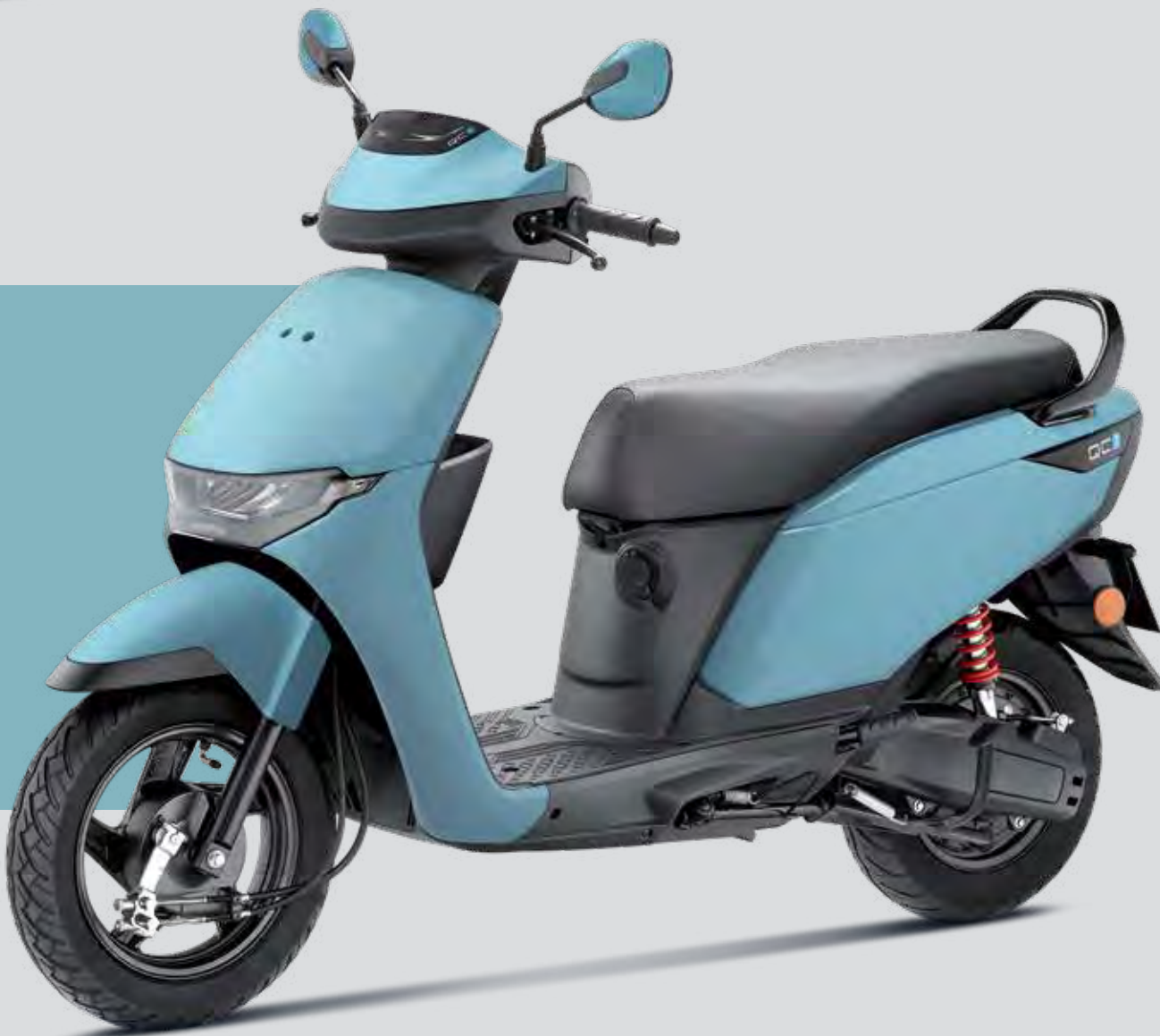
Pearl Shallow Blue