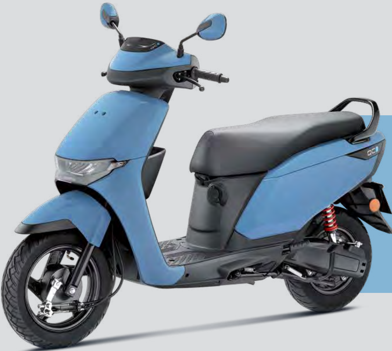
Pearl Serenity Blue

Choose from a range of stunning colours that reflect your personality.