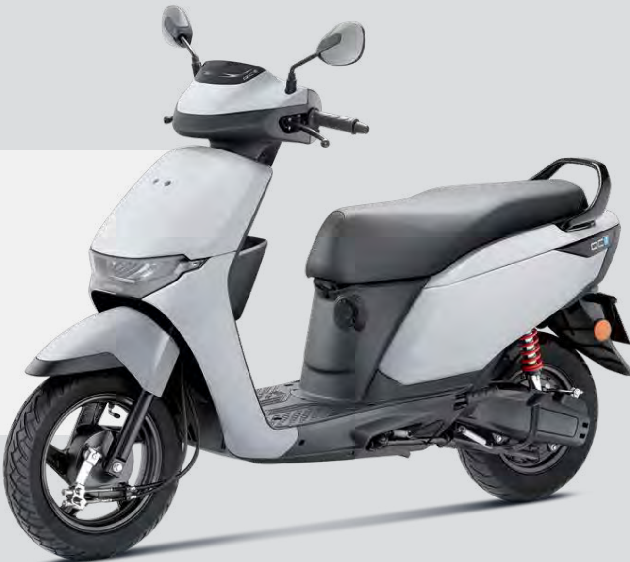
Pearl Misty White