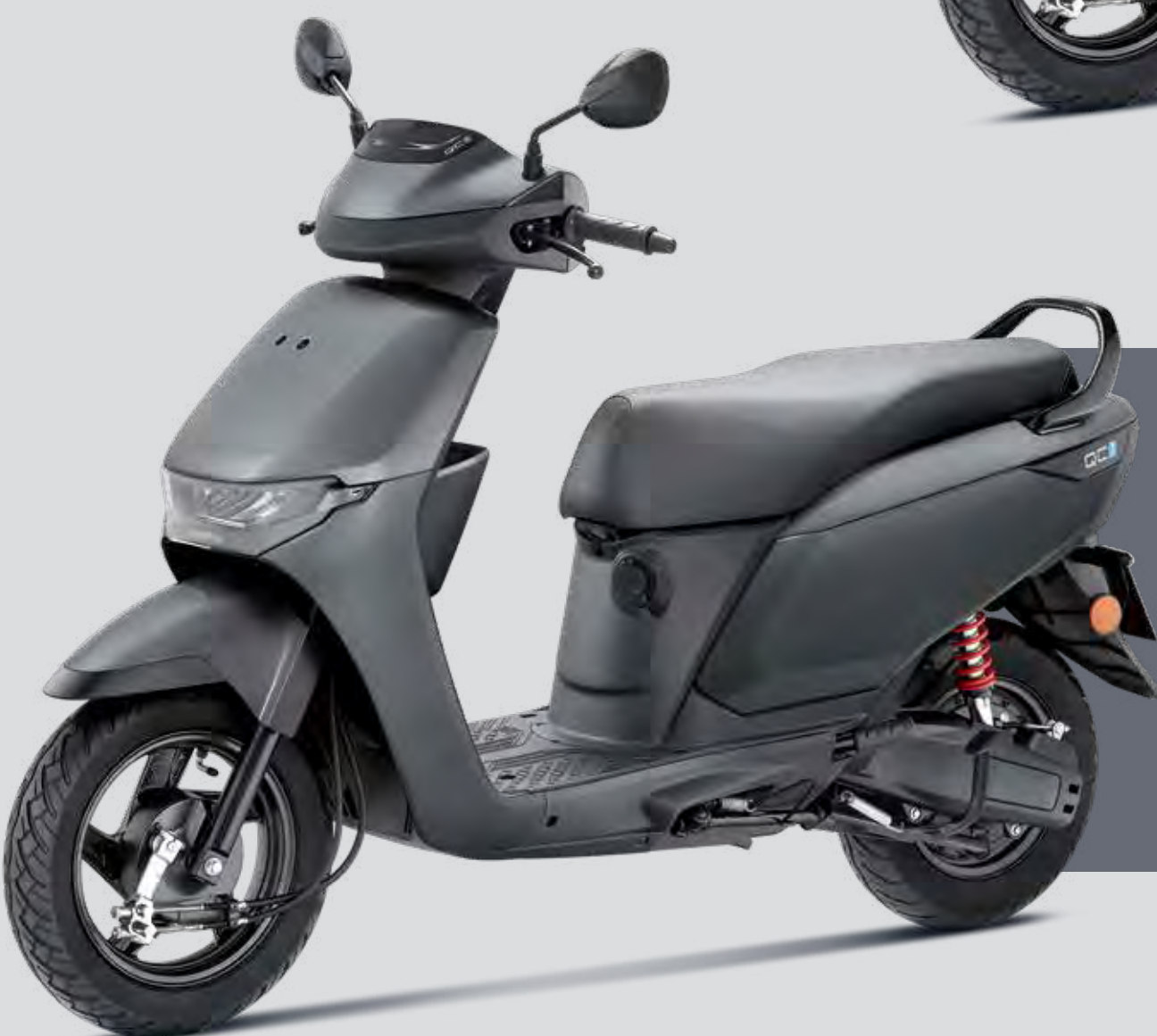
Matt Foggy Silver Metallic